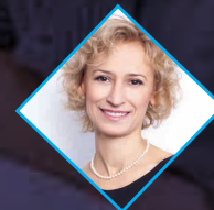
Kinga Stanisławska Exporior Venture Fund