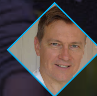
Rafał Pluteck Campus Warsaw